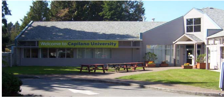
Sunshine Coast Campus