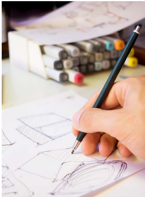
Illustration / Design: Elements & Applications (IDEA)